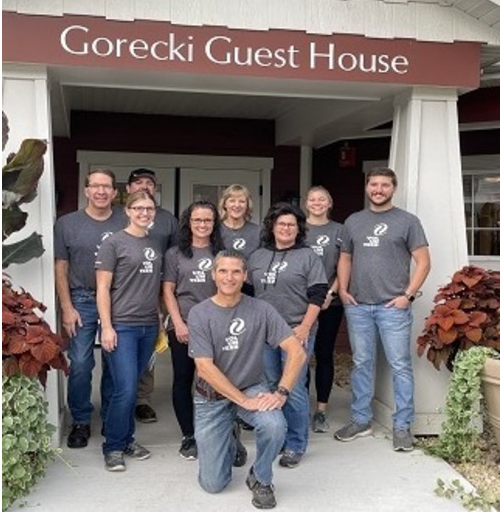
Xcel Energy volunteers returned for their eighth year of fall clean-up projects at the Gorecki Guest House. One volunteer shared that she wanted to give back as her family used the Guest House when her mom was in the ICU. She said it was a Godsend for their family.