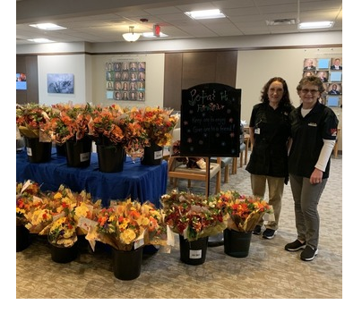
Coborn's Flower Shoppe hosting its "Petal it Forward" event at Coborn Cancer Center. Many patients and employees received two bouquets – one to keep for themselves and a second one to give away.