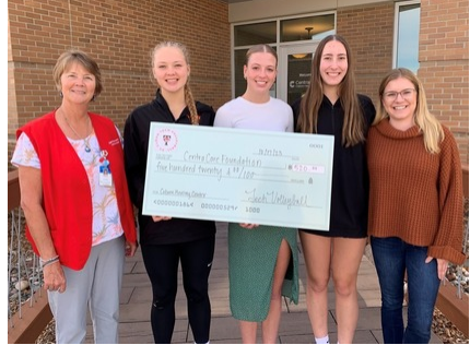
The St. Cloud Tech Volleyball team raised $520 at their Oct. 2 Dig Pink event to benefit cancer survivors at the Coborn Healing Center.