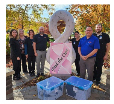
For the ninth year in a row, Miller Auto Plaza donated one seatbelt cover to Coborn Cancer Center for each person who test drove a vehicle during October. These seatbelt covers provide comfort to patients receiving cancer treatment.