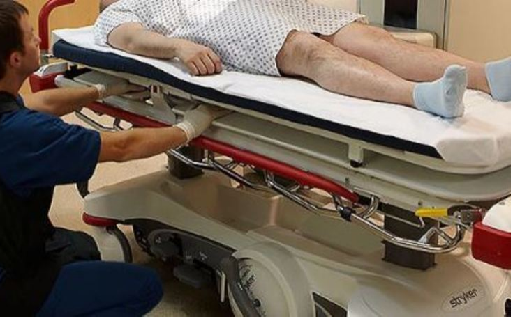
Staff can slide the X-ray cartridges between the cart and the stretcher without having to move the patient.