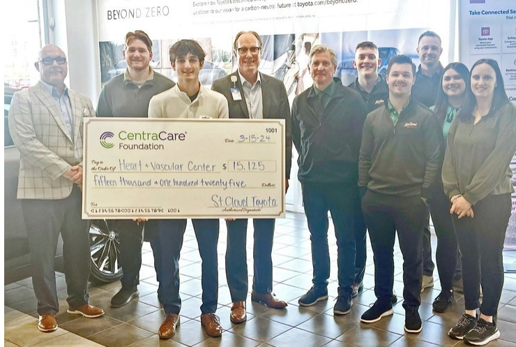
Thank you, St. Cloud Toyota, for supporting our Heart & Vascular Center patients! During American Heart Month in February, they donated $100 for every used vehicle purchased raising a total of $15,125!