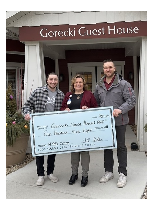
Thank you to All-Star Nutrition for conducting a New Year, New You challenge for their clients. They donated $1 to Gorecki Guest House for every percent of weight lost or muscle gained. The final gift was $568!