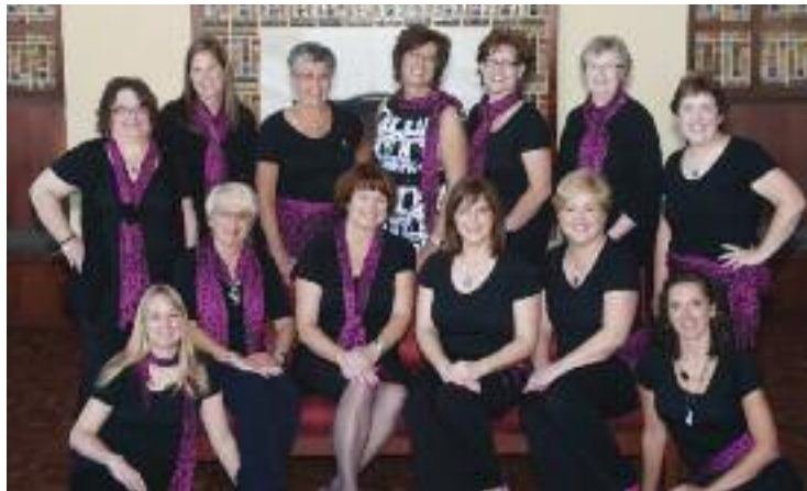
Thank you to our volunteer committee for the 2011 Surviving with Style fundraiser for the St. Cloud Hospital's Breast Center.