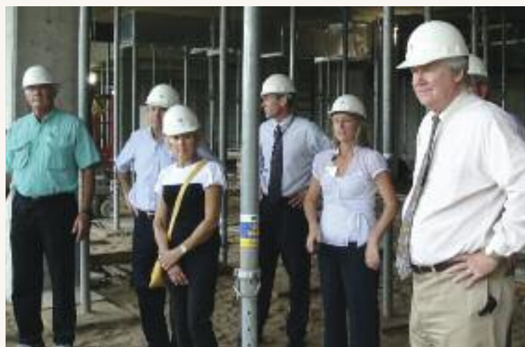
The Caring For Generations Cabinet toured the St. Cloud Hospital expansion during the early days of the project.