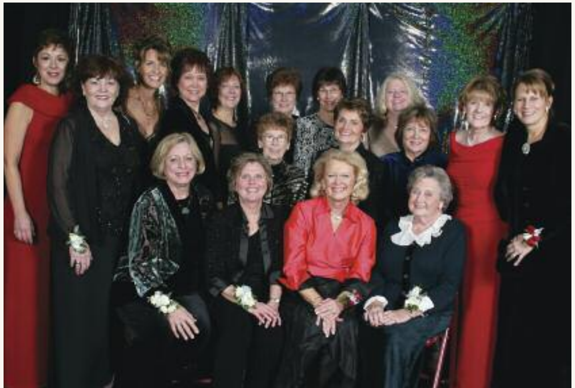
Thank you to all of the past chairs of Holly Ball, which has raised nearly $3.4 million for St. Cloud Hospital Hospice over the past 37 years.